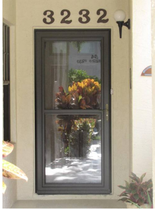
GLAZED FRONT DOOR NOT PROTECTED.