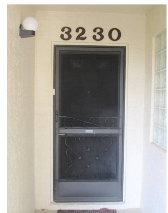
FRONT GLAZED DOORS NOT PROTECTED.

Inspectors Initials M.J.E. Property Address 3224, 3226, 3228, 3230, 3232, 3234, 3236, And 3236 Jog 33467.