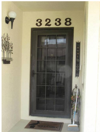
FRONT GLAZED DOOR NOT PROTECTED.