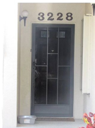
FRONT GLAZED DOOR NOT PROTECTED.