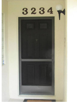
FRONT GLAZED DOORS NOT PROTECTED.