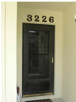
FRONT GLAZED DOOR NOT PROTECTED AND SWINGS IN.