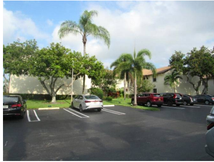
FRONT VIEW SOME GLAZED NOT PROTECTED.