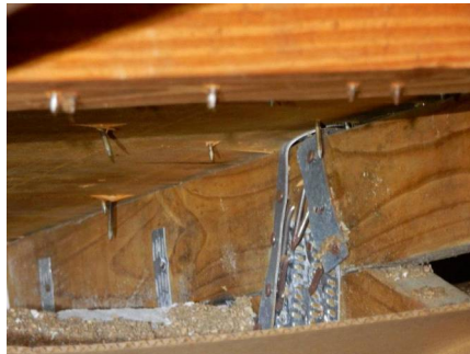
FRONT DOUBLE STRAP VIEW.