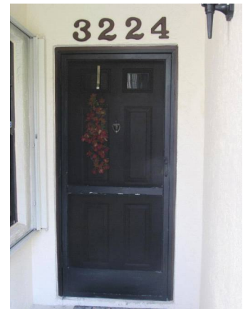
FRONT GLAZED DOOR NOT PROTECTED.