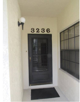
FRONT GLAZED DOOR NOT PROTECTED.