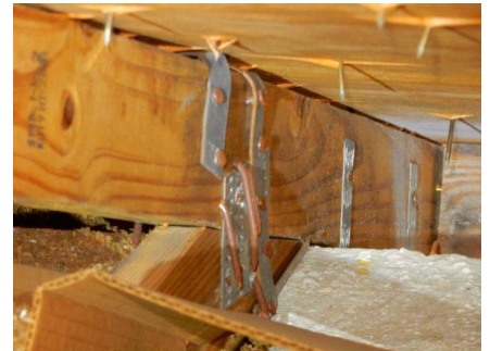
REAR DOUBLE STRAP VIEW.