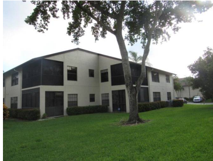
LEFT VIEW SOME GLAZED NOT PROTECTED.