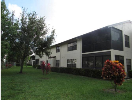
BACK VIEW SOME GLAZED NOT PROTECTED.