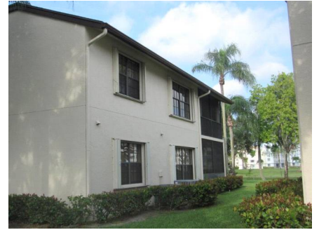
SOME GLAZED NOT PROTECTED.